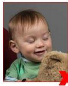
Eyes not open/toy visible