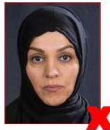
Background too dark