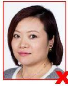
Side on to camera