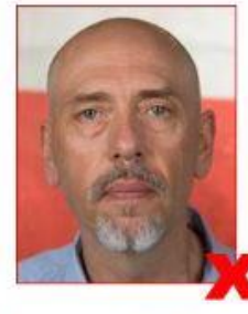
Background not plain