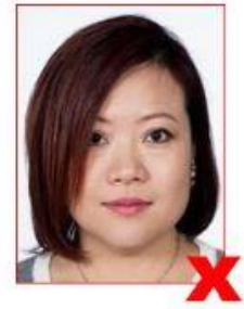
Hair obscuring face