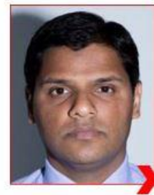
Shadows on image and background