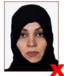
Eyes/edges of face obscured